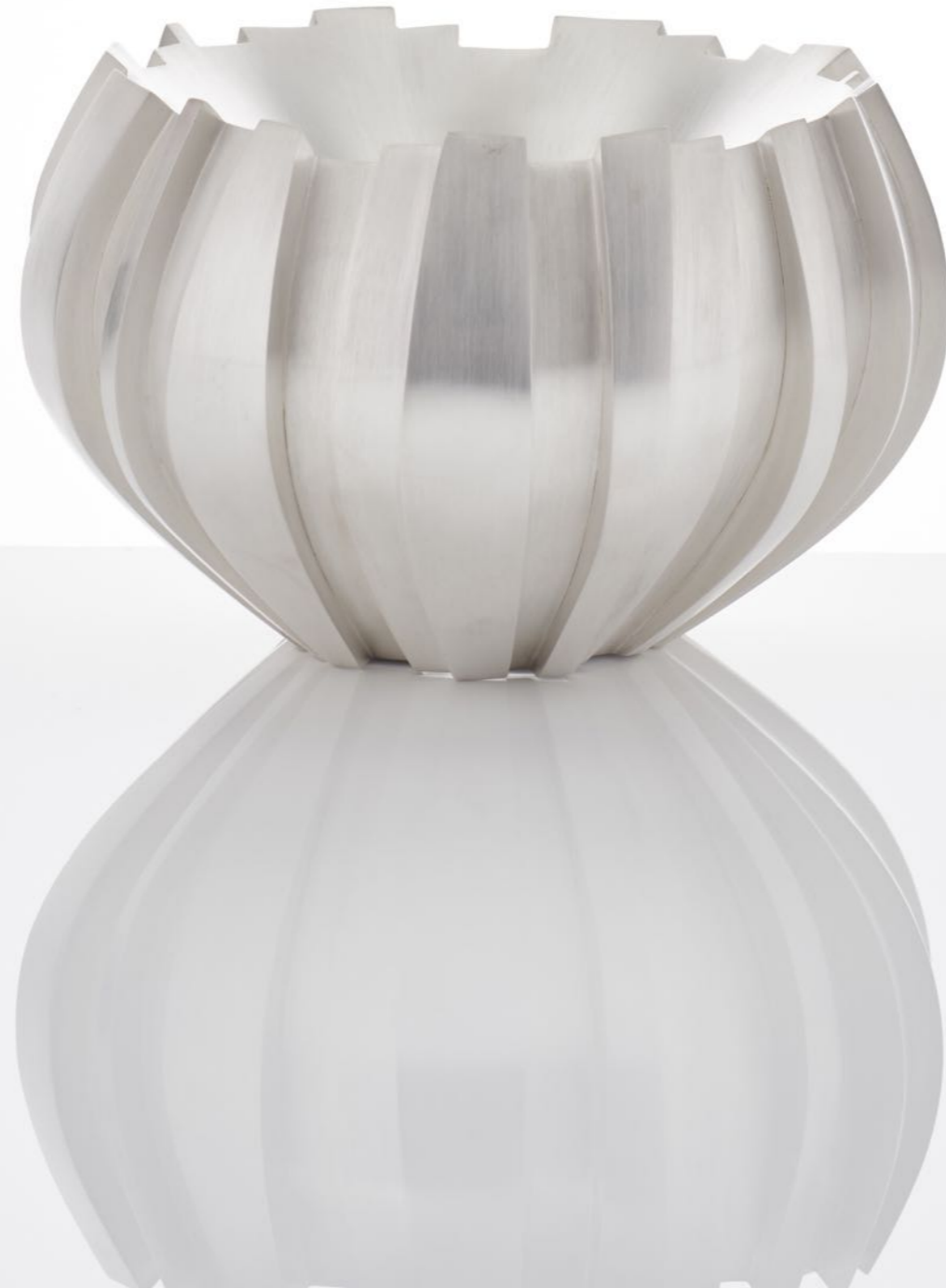
KEVIN GREY Tranquility 1202, 2019 Welded Fine silver 999, 1,160g Height 10cm (3 7/8") £ 12,000